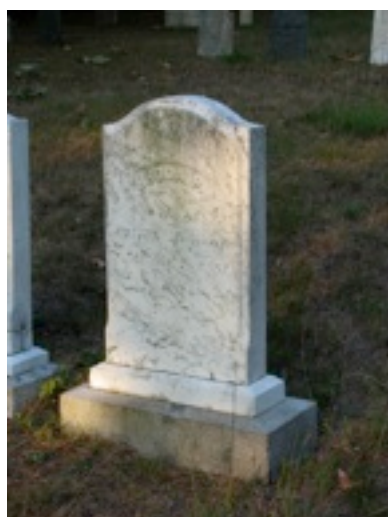
Gravestone on pedestal

A major issue in some locations is that marble gravestones are placed on pedestals and that people have become confused about the location to take measurements, as there have been no notes in the protocols on how to proceed.