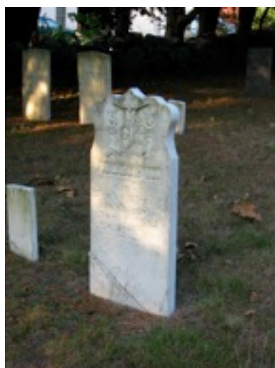
Gravestone with NO pedestal

We are working on a change to the protocols and database which will allow measurements to be taken on these gravestones. However it will continue to be our preference to have people collect data on non-pedestal marble gravestones.